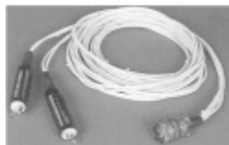
Spike Probe Leads